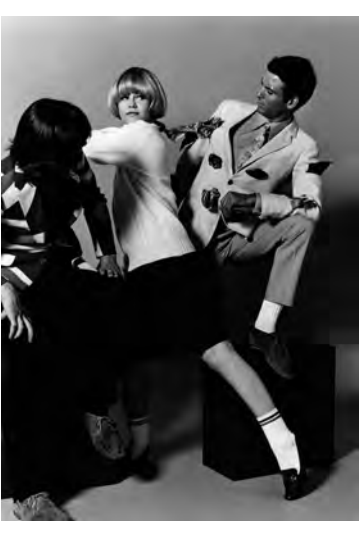
Right : pure virgin wood multi-pocket jacket, 1966.