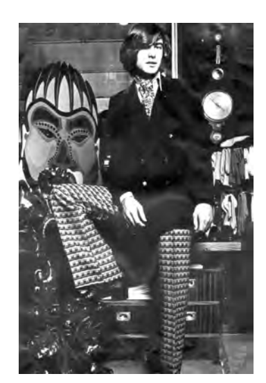
Suit: double-breasted jacket and trousers with geometric motif, 1970.