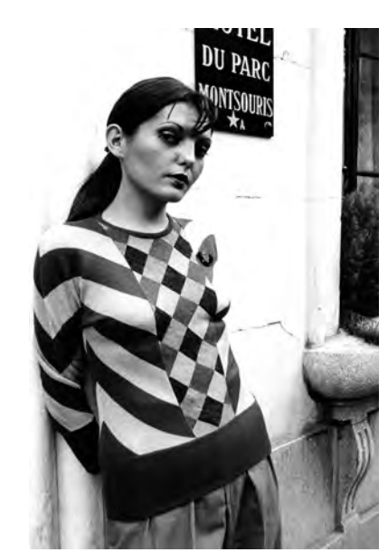
Wood & cashmere Fair Isle jumper, 1974.