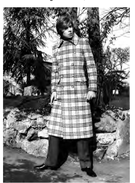
Double-breasted tartan coat, 1966.