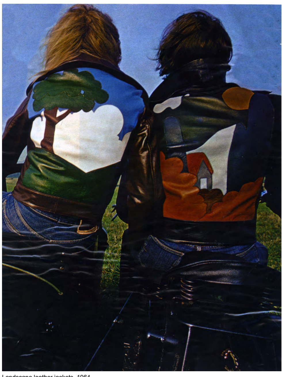
Landscape leather jackets, 1964.