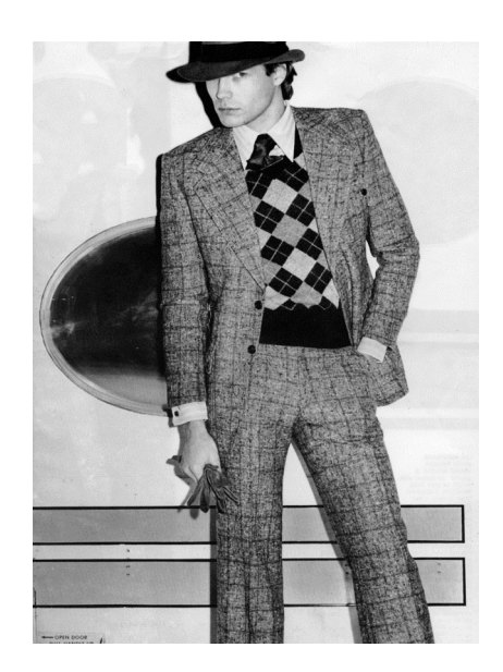
Plaid tweed suit, 1974.