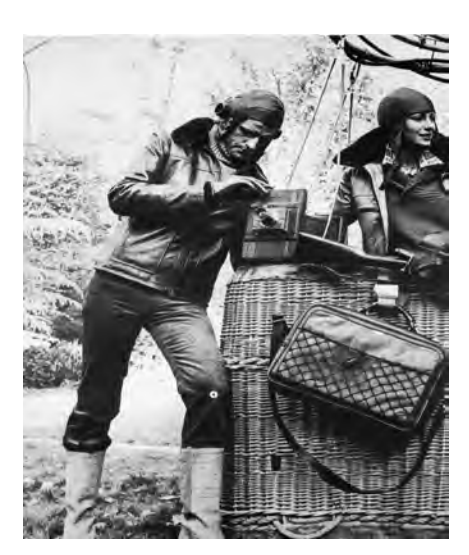
Fishnet bag, 1976.