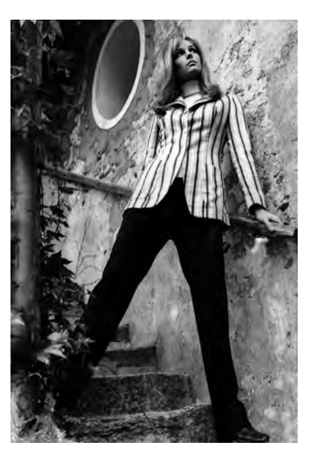
Striped blazer, 1964.