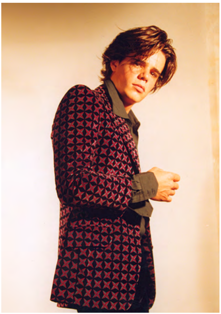
Vasarely velvet jacket, 1968.