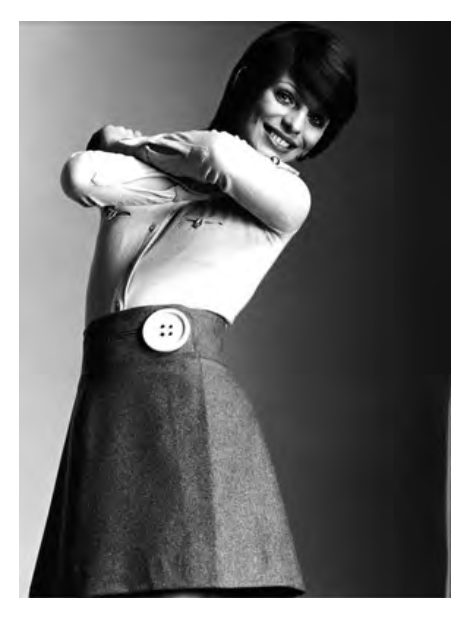
Mini-skirt with a giant button, 1966.