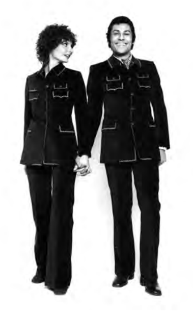
\label{lem:velvet} \mbox{Velvet $\alpha$ Danton $\ast$ suit, leg-of-mutton sleeves and $\alpha$, $$Zigzag overstitchings, 1964.}