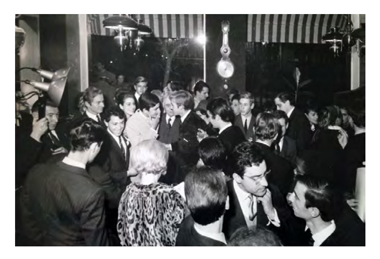
White House – Renoma store opening, 23rd october 1963.