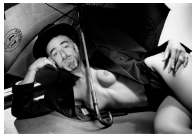
Mythologies II, 905-741, 2013 - © Maurice Renoma

Through hybrid beings with a revisited manhood, Mythologies II shows a soothed and funny version of man/woman duality.