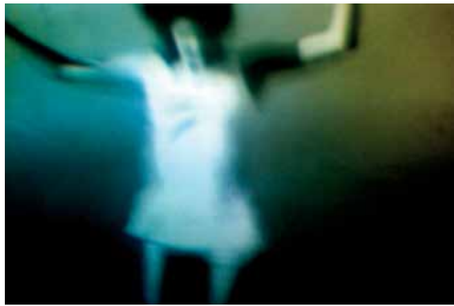
Normandie, 1999

Preview :Wednesday February 17th 2016 From 6:00 pm to 9:00 pm at the Town Hall of the 3rd arrondissement