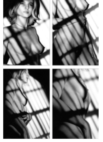
CHENAUX GALLERY ACTE PULSIONNEL (IMPULSIVE ACT)