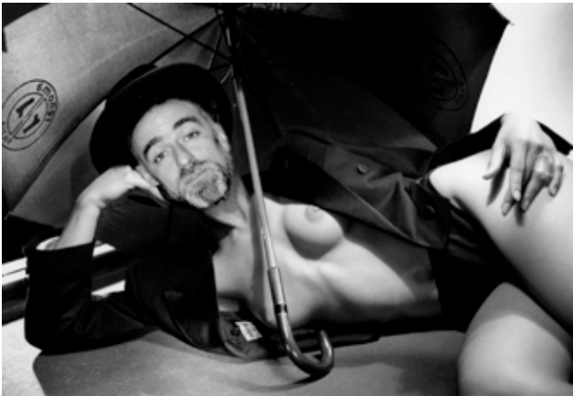
Mythologies II, 905-741, 2013 - © Maurice Renoma

Through hybrid beings with a revisited manhood, Mythologies II shows a soothed and funny version of man/woman duality.