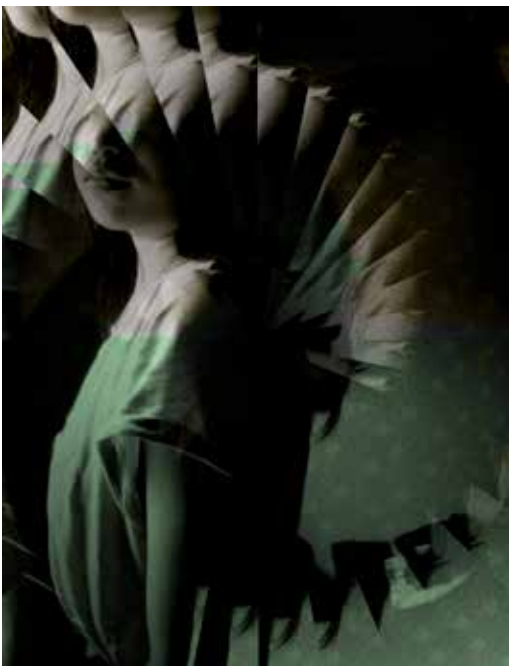
Chelsea Psychedelic, 2015 - © Maurice Renoma

The Town Hall of the 3rd arrondissement hosts a scenography by Maurice Renoma. A rock and arty lounge introduces you to the artist's mind and offbeat world.