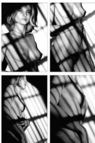
Florence, 1999

From Monday to Sunday from 10:00 am to 12:00 am and fro 1:00 pm to 7:00 pm