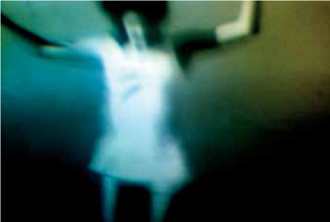
Normandie, 1999

Preview : Wednesday February 17th 2016 From 6:00 pm to 9:00 pm at the Town Hall of the 3rd arrondissement