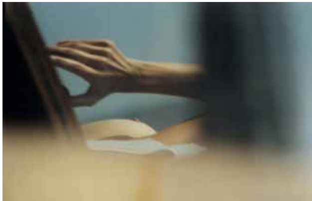
Mystères, 393, 1997 - © Maurice Renoma

A play on the frontiers between fiction and reality, light and shadow. His artistic approach is stamped with aesthetics and harmony.