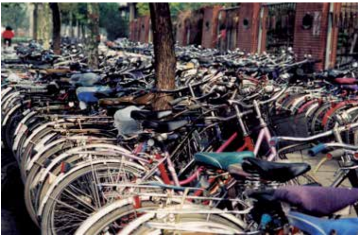
Chine, 870, 1994 - © Maurice Renoma

The photographer sets his eye on the meteoric rise of the Middle Kingdom trying to catch up with and overtake the greatest world capitalist powers.