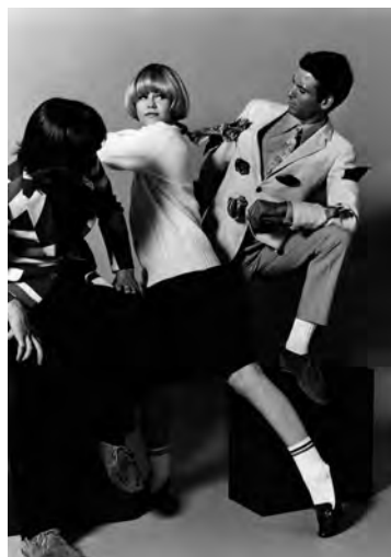
Right : pure virgin wool multi-pocket jacket, 1966.