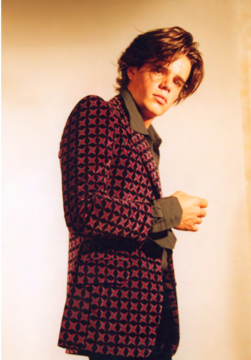
Vasarely velvet jacket, 1968.