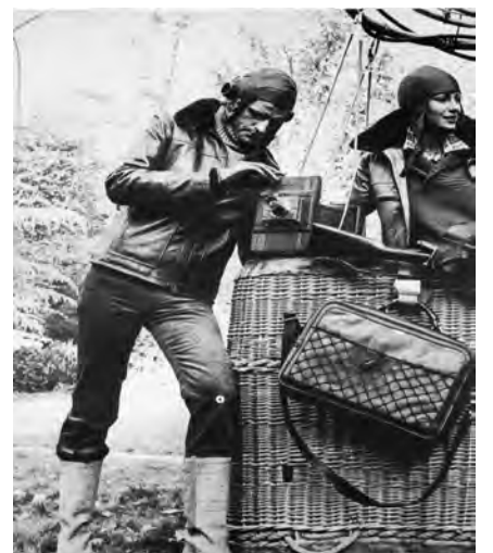
Fishnet bag, 1976.