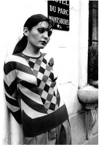
Wood & cashmere Fair Isle jumper, 1974.