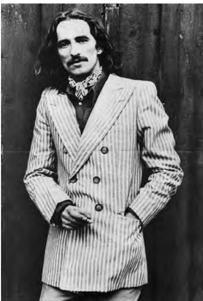
Double-breasted six buttons blazer, 1971.