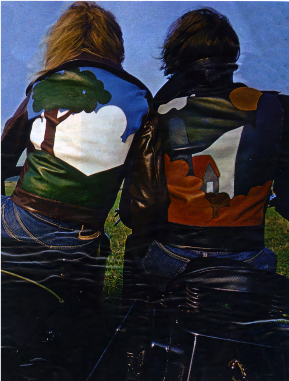
Landscape leather jackets, 1964.