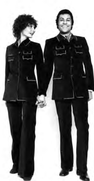
Velvet « Danton » suit, leg-of-mutton sleeves and , Zigzag oversteichings, 1964.