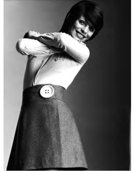
Mini-skirt with a giant button, 1966.