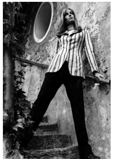
Striped blazer, 1964.