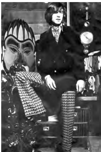
Suit: double-breasted jacket and trousers with geometric motif, 1970.