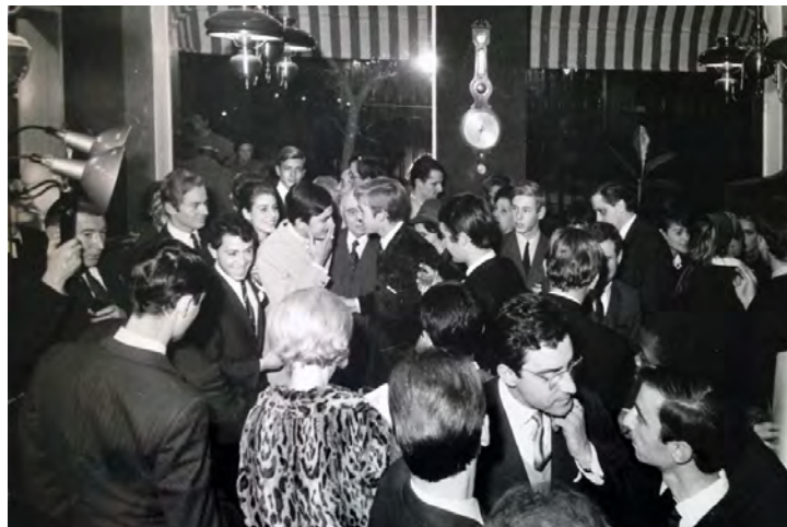
White House – Renoma store opening, 23rd October 1963.