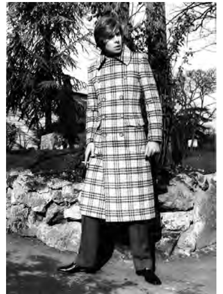
Double-breasted tartan coat, 1966.