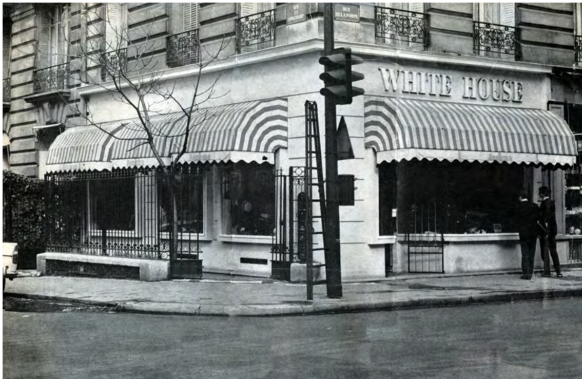
The White House – Renoma store, 1963.

www.renoma-paris.com www.renoma.wordpress.com