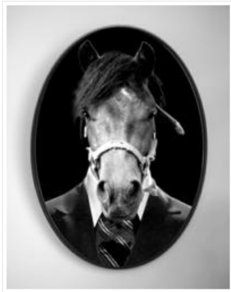
Exhibit ends January 2nd, 2013.