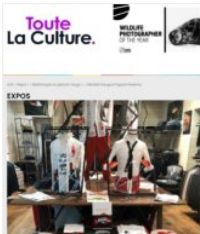
TOUTE LA CULTURE