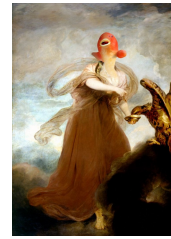
© graphic design Maurice Renoma & Joshua Reynolds

When Maurice Renoma diverts the classics: a burlesque illusion?