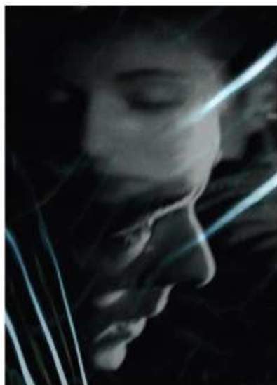
© Maurice Renoma - Série Soutres et Abrisés - 045

cohabitation between the human and the monster.