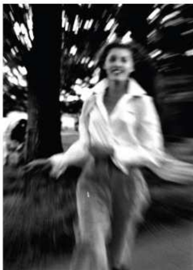
© Maurice Renoma - Abrisés 070